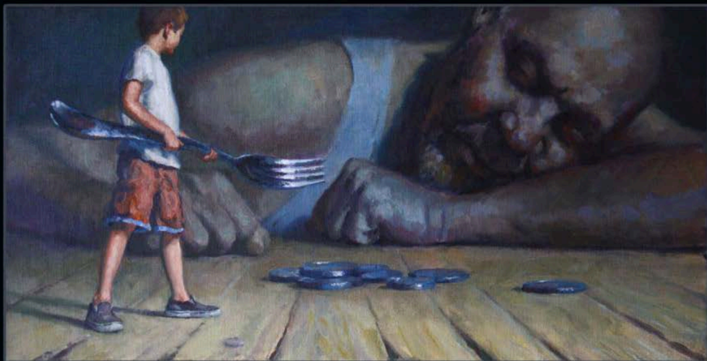
SLEEPING GIANT OIL ON CANVAS 2013