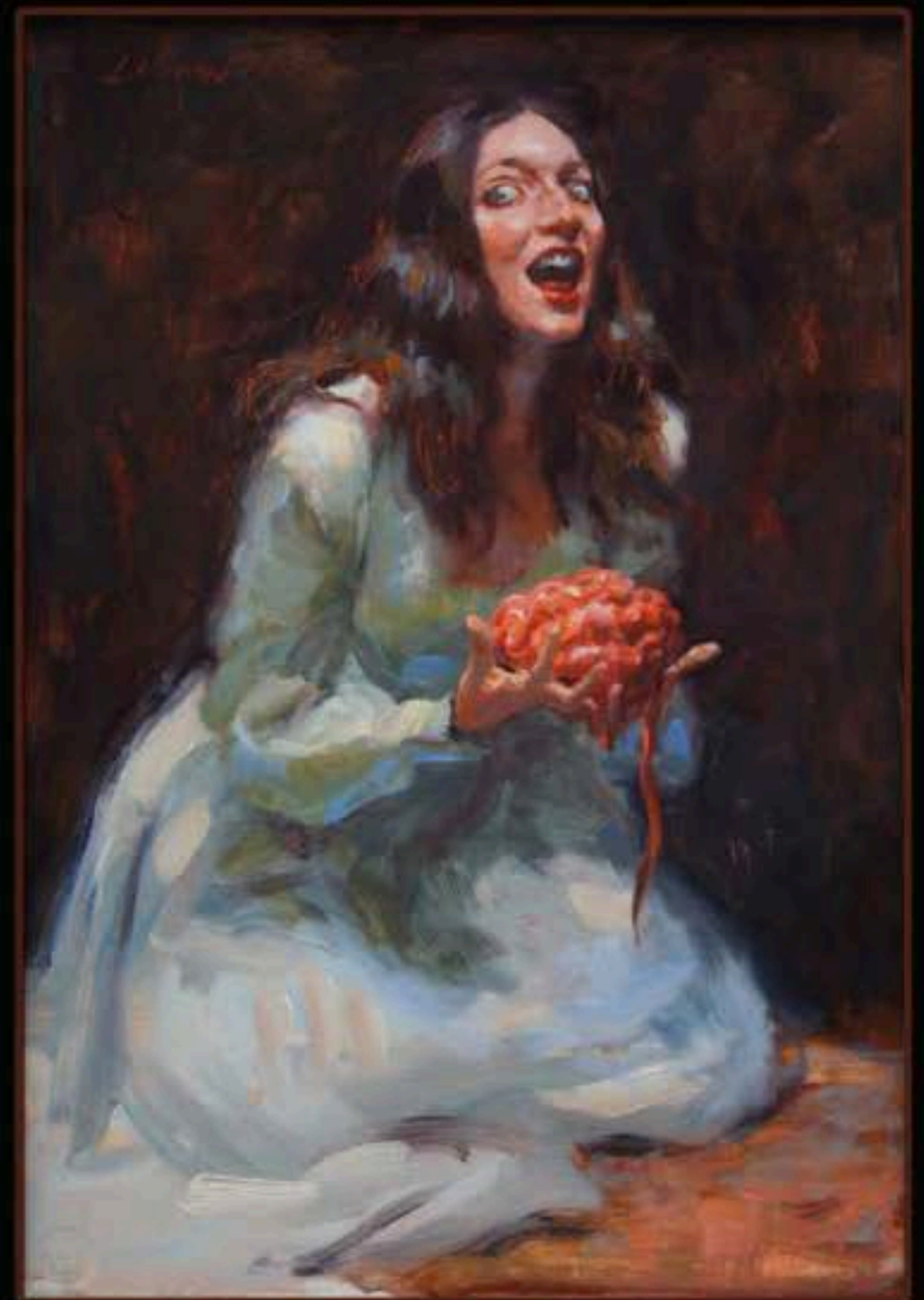
BRAINS OIL ON CANVAS 2012