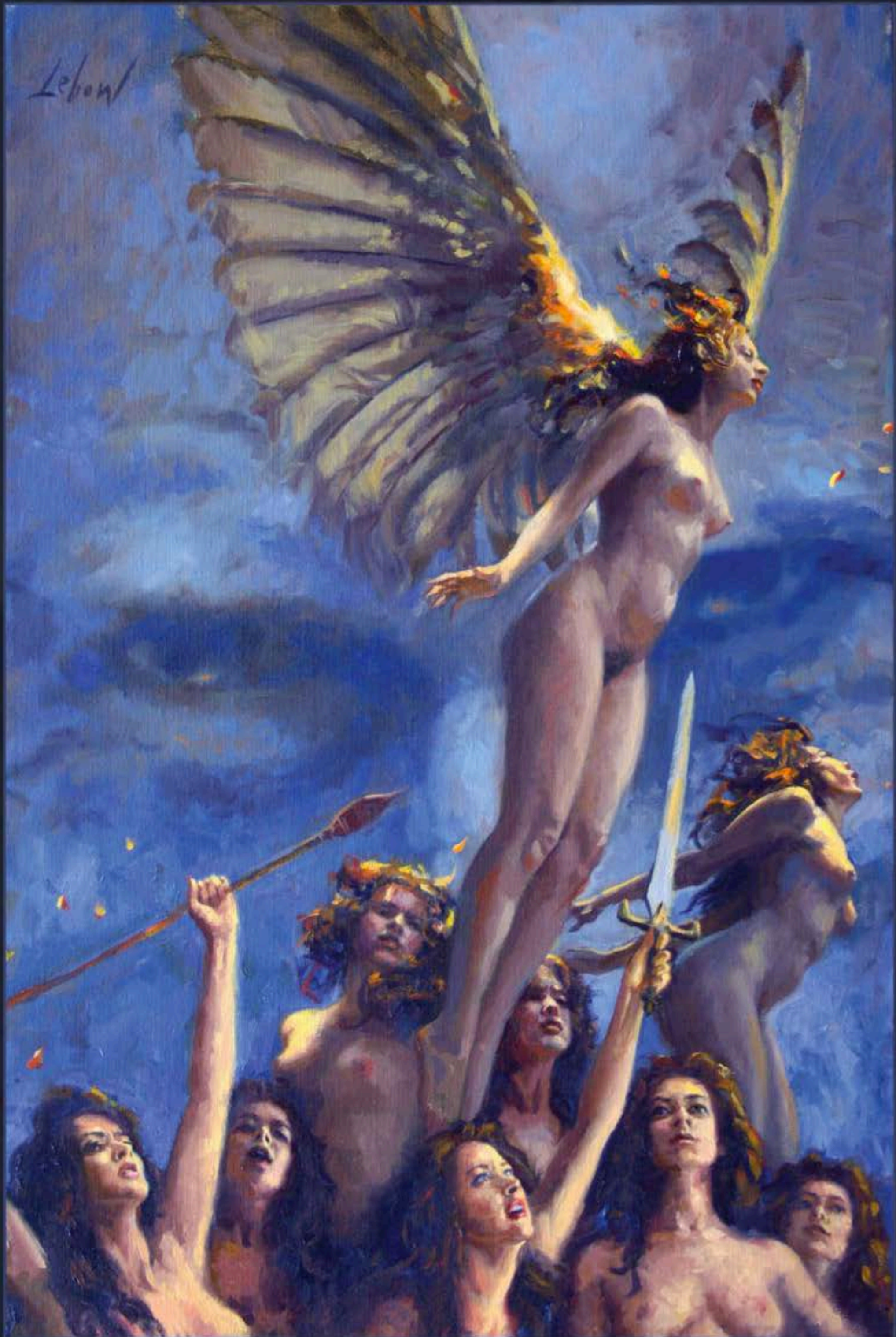
ALL THAT GLITTERS OIL ON CANVAS 2013