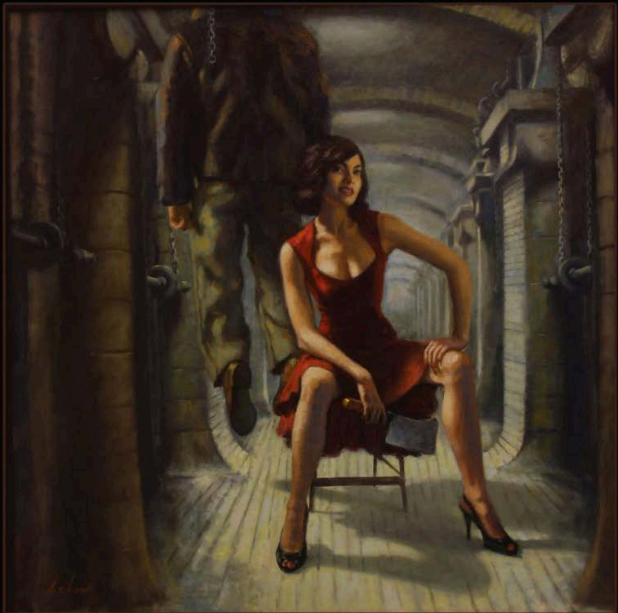
DIVORCE OIL ON CANVAS 2013