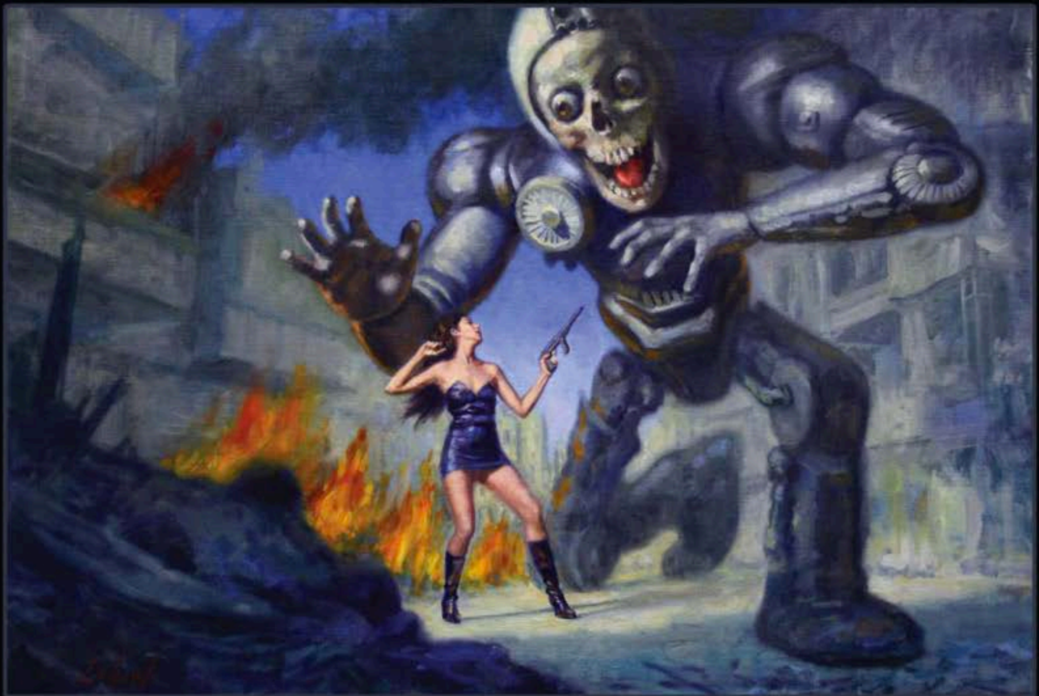
DESTRUCTIVE LOVE OIL ON CANVAS 2013