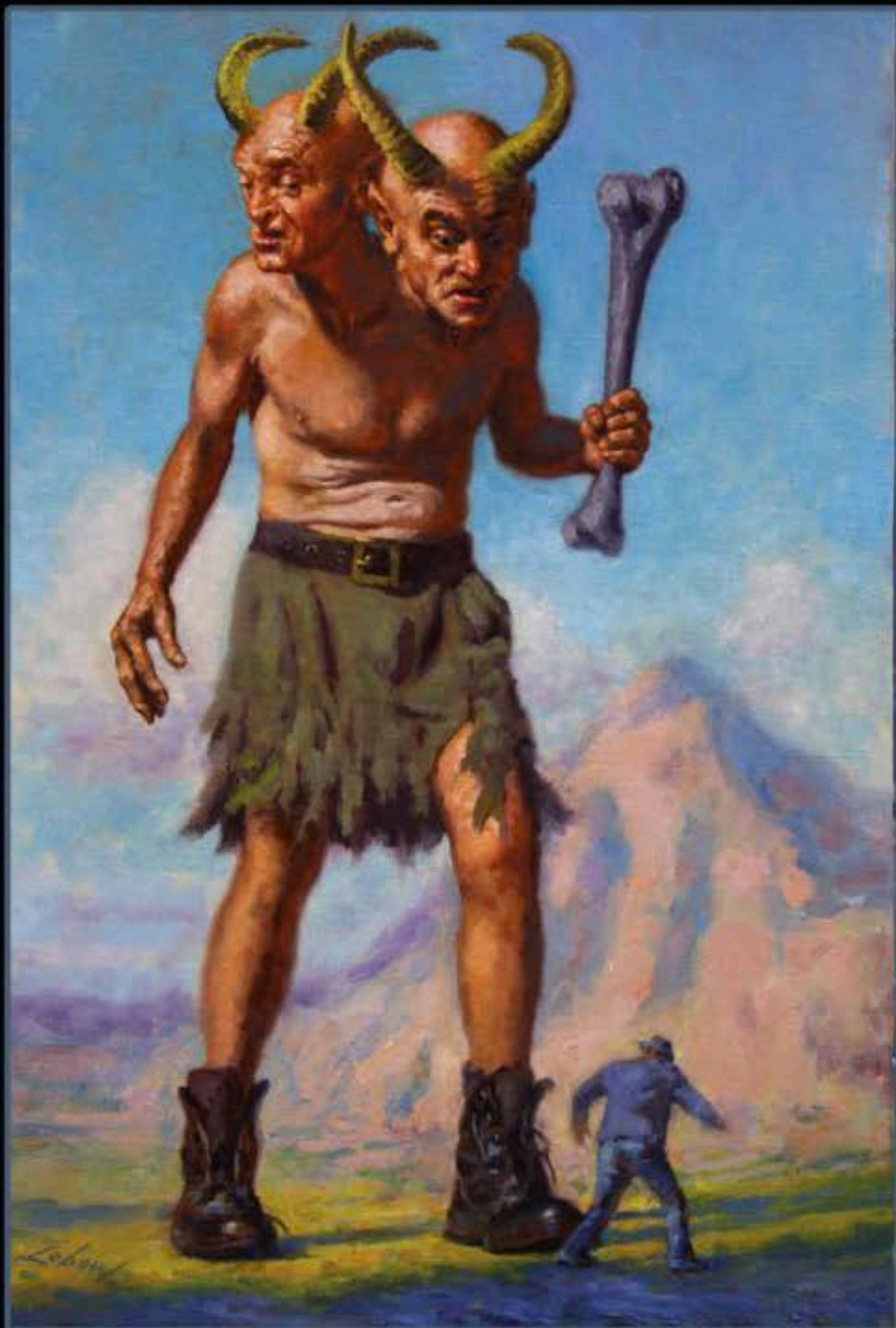
TWO HEADED GIANT OIL ON CANVAS 2013