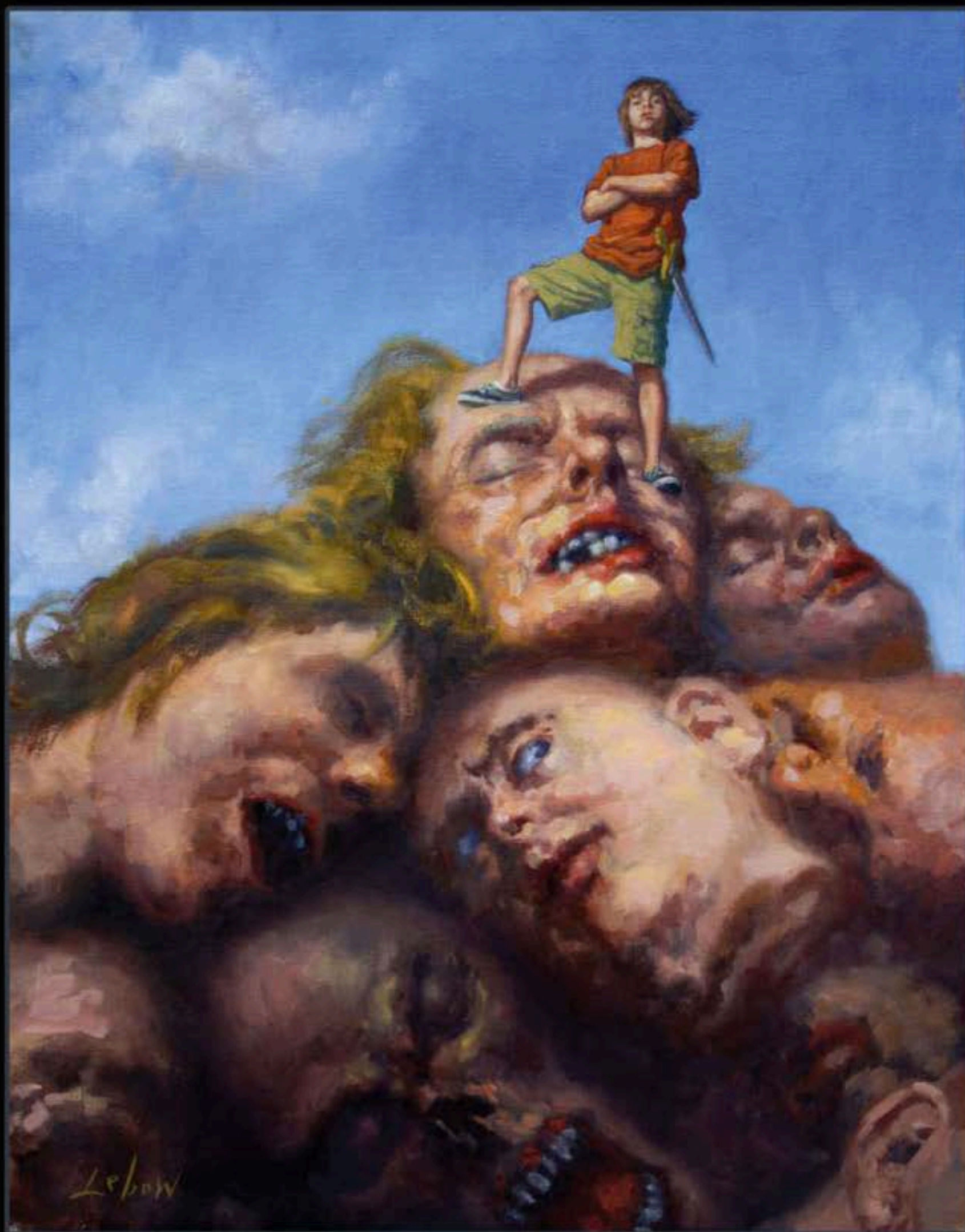
BOY WITH TROLL'S HEADS OIL ON CANVAS 2013