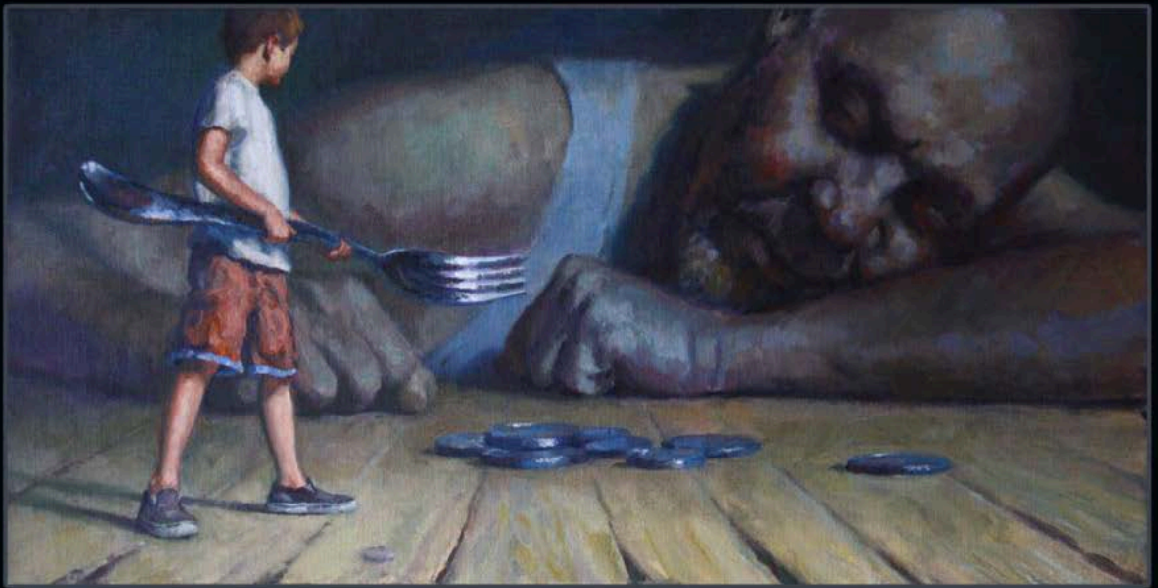
SLEEPING GIANT OIL ON CANVAS 2013