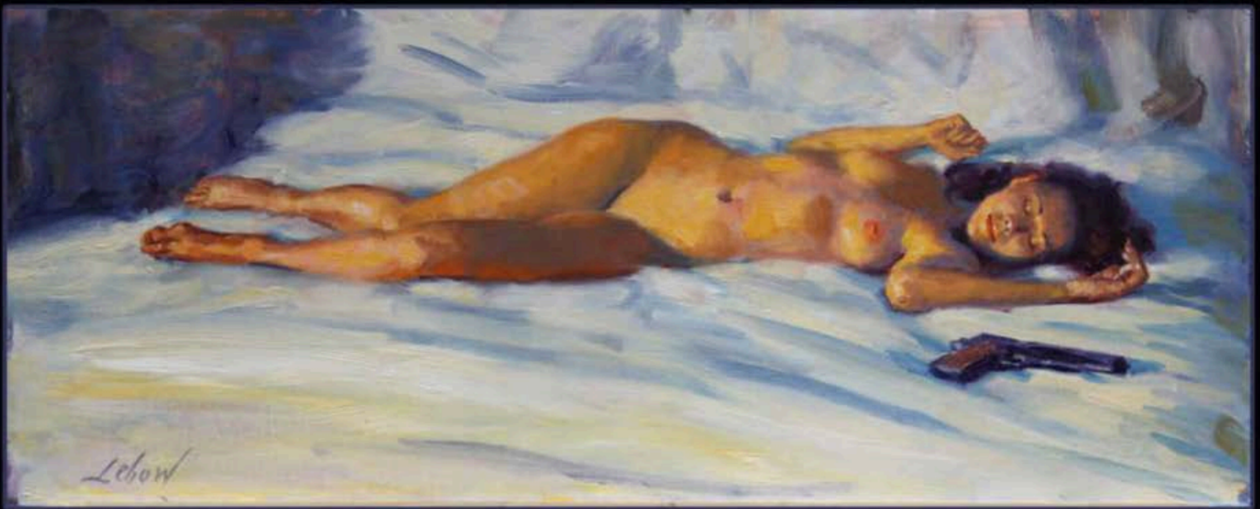
NUDE WITH GUN OIL ON CANVAS 2013