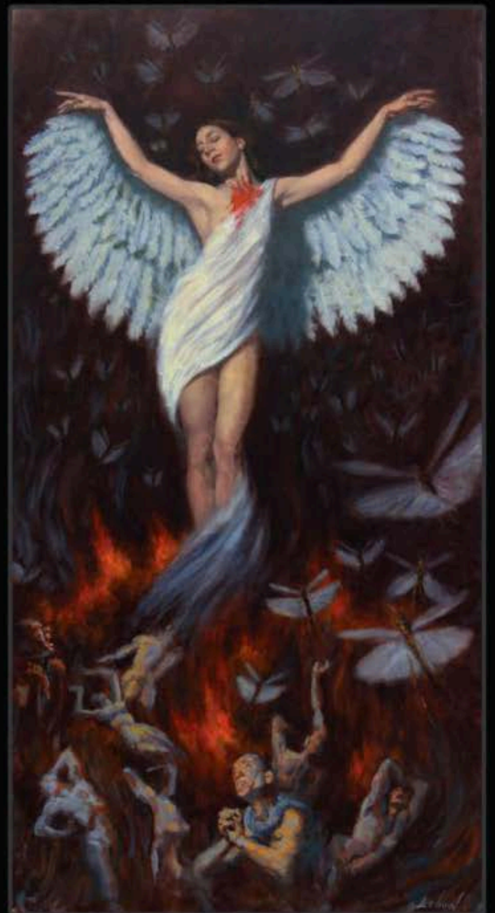
ANGEL OF DEATH OIL ON CANVAS 2011