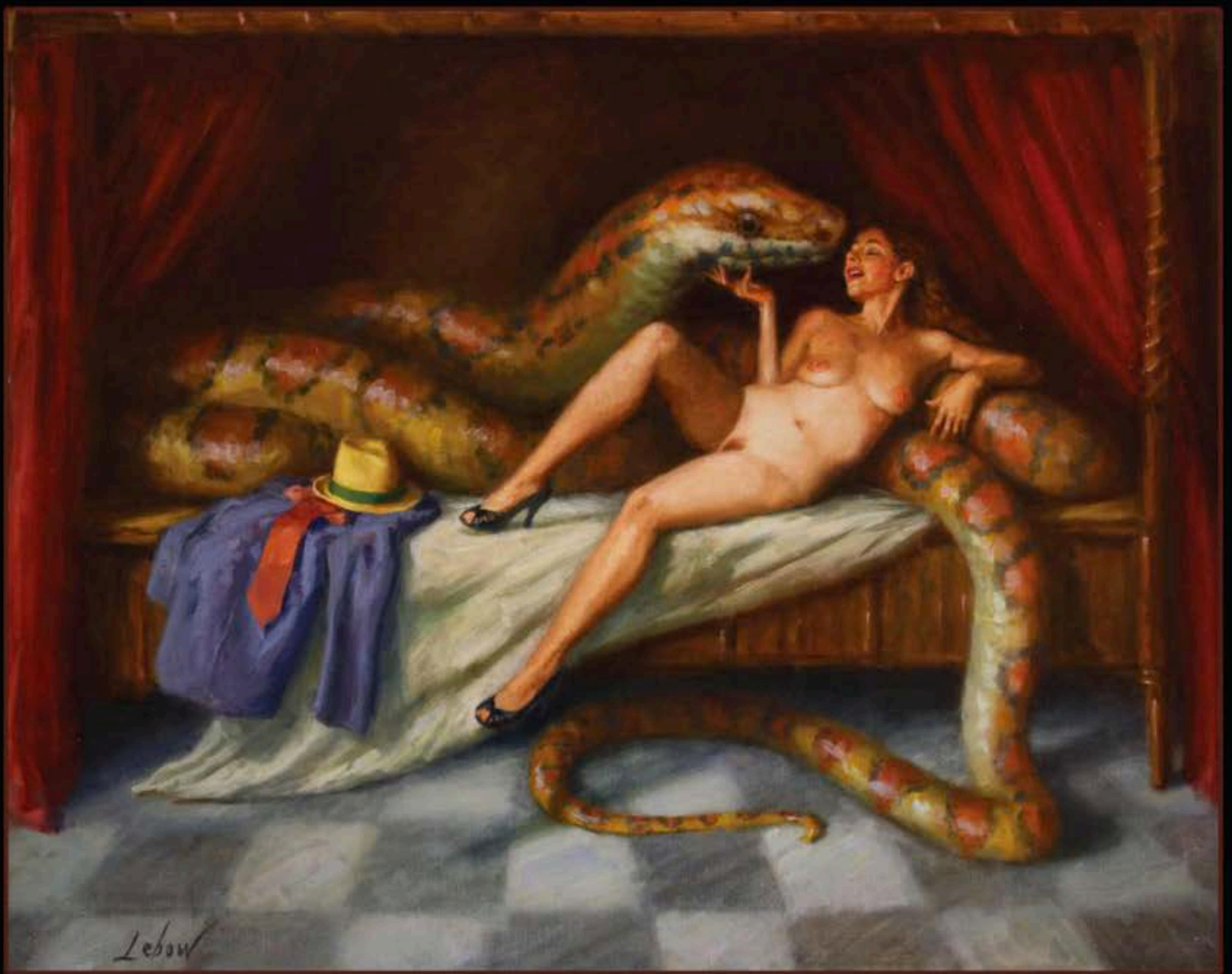
CONVERSATION OIL ON CANVAS 2013