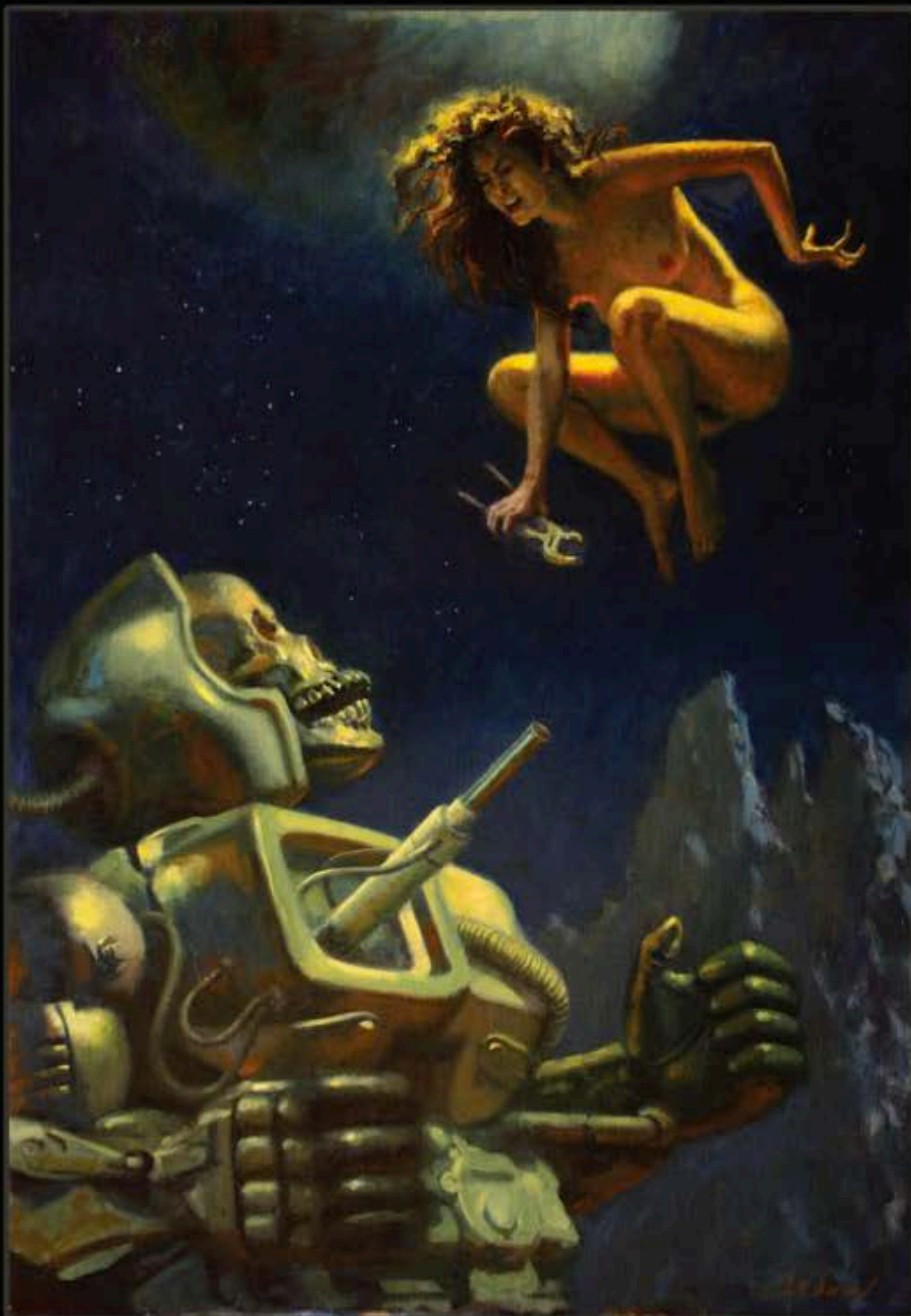
BATTLE PLANET OIL ON CANVAS 2012