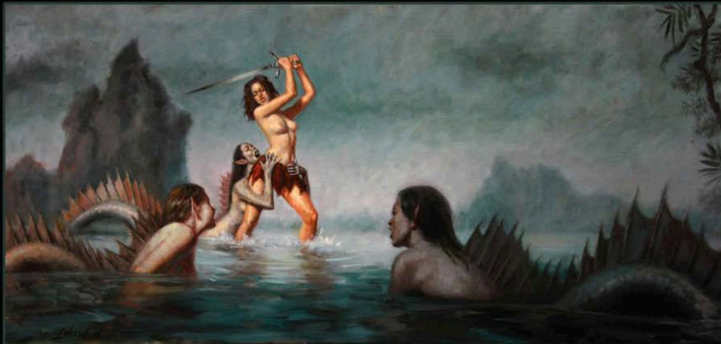
ATTACK OF THE VAMPIRE WATER NIXIES OIL ON CANVAS 2013