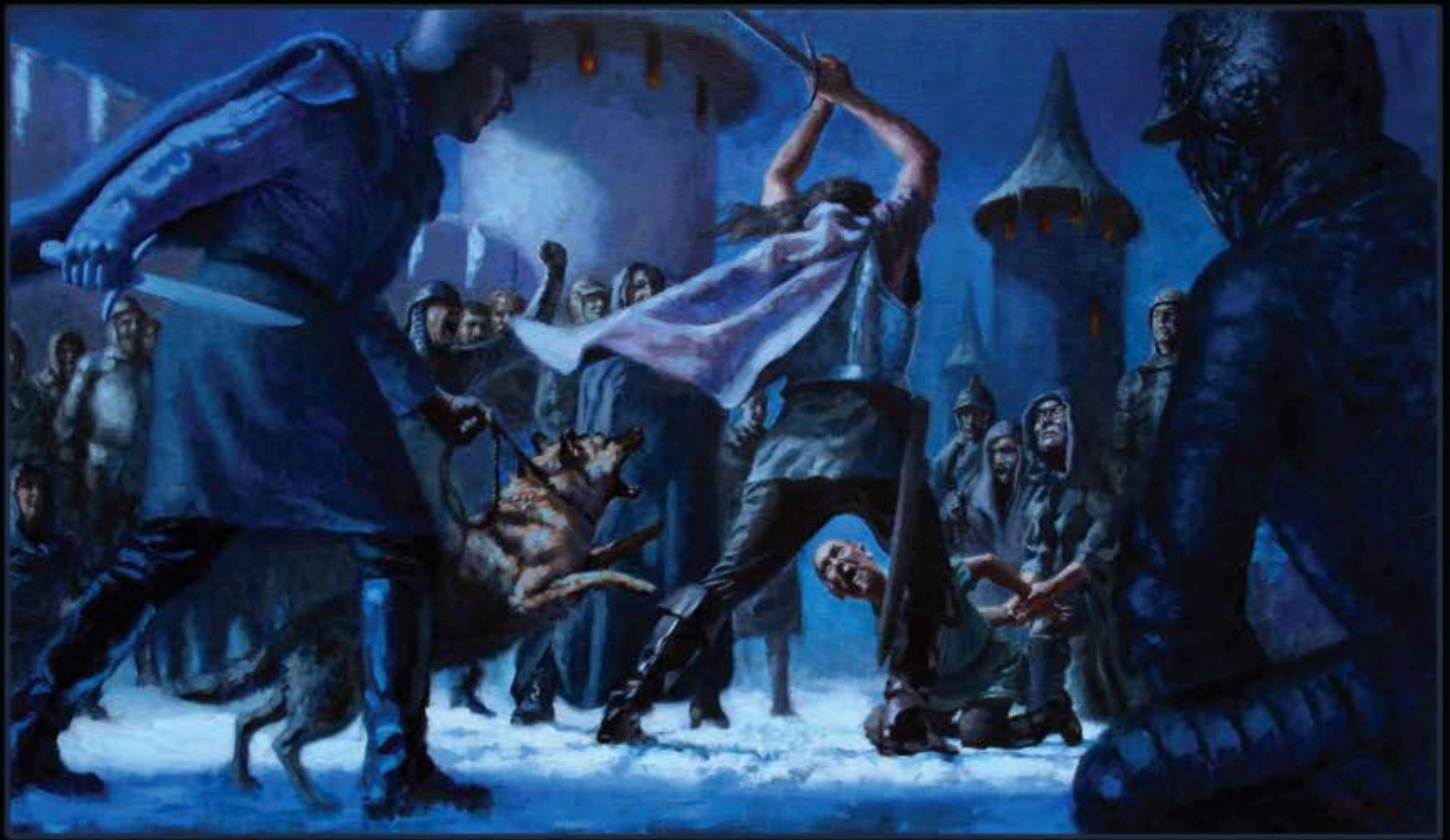
ENCHANTED SWORD OIL ON CANVAS 2013