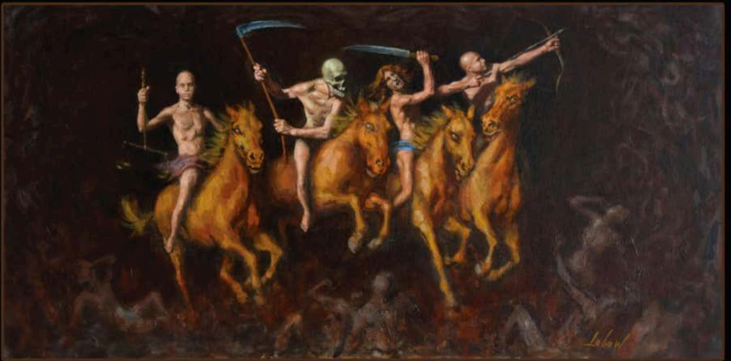
FOUR HORSEMEN OIL ON CANVAS 2011